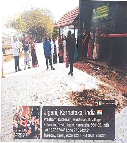
Jigani, Karnataka, India Prashanti Kuteeram, Giddenahalli Village, Kalabalu, Post, Jigani, Karnataka 560105, India Lat 12.756764° Long 77.624212° Tuesday, 13/01/2026 12:44 PM GMT +05:30