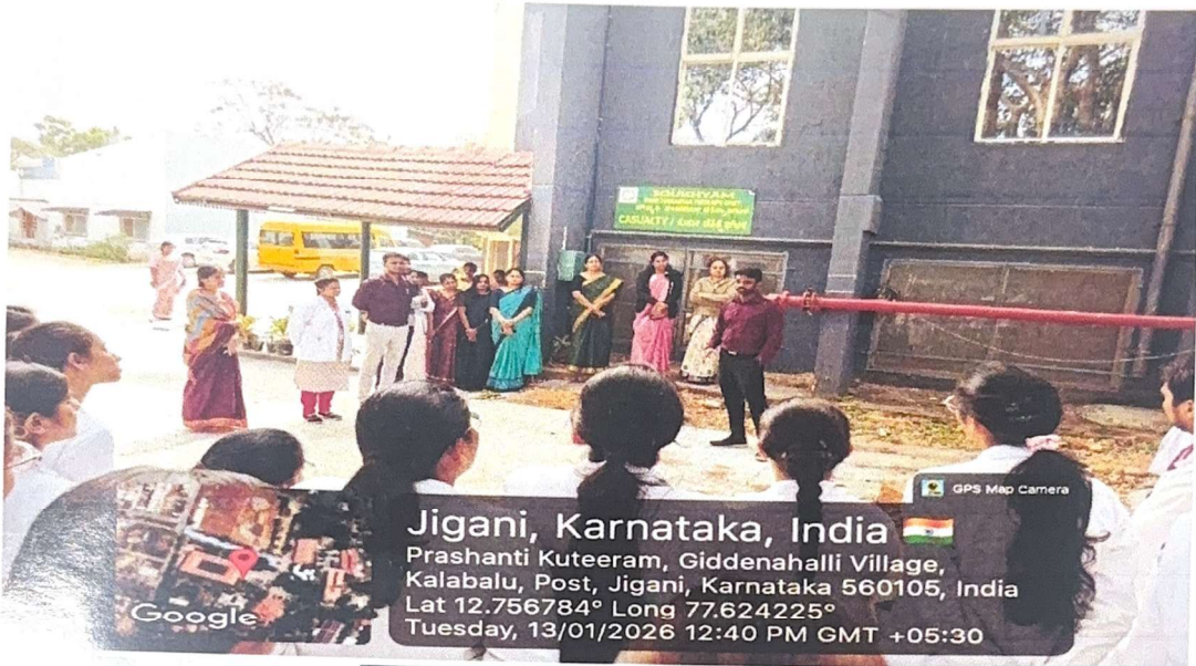
Jigani, Karnataka, India Prashanti Kuteeram, Giddenahalli Village, Kalabalu, Post, Jigani, Karnataka 560105, India Lat 12.756784° Long 77.624225° Tuesday, 13/01/2026 12:40 PM GMT +05:30